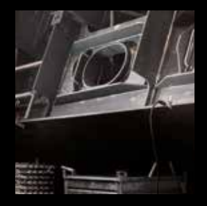
Download technical info